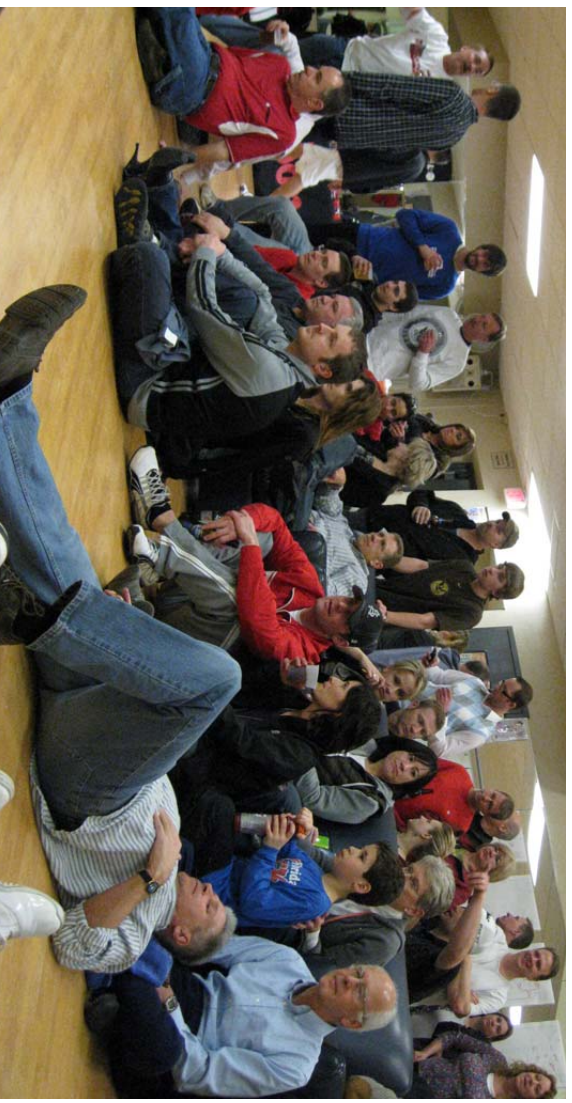
Crowd watching men's singles final.